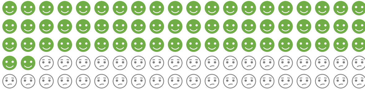
- School Climate and Connectedness Survey (2019)

62 OUT OF 100 STUDENTS agreed or strongly agreed that they feel like ADULTS AT SCHOOL CARE ABOUT THEM.